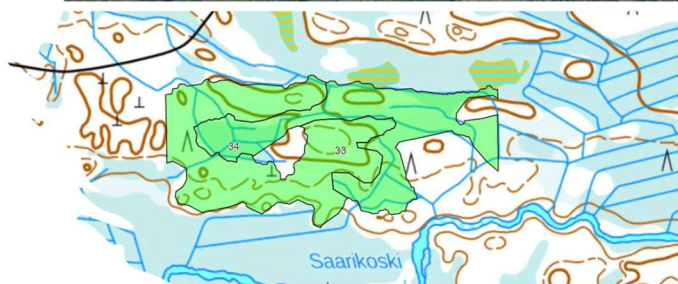
The location of 'N Rent forest'